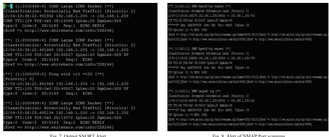
Fig. 7. Output SNORT Alert.