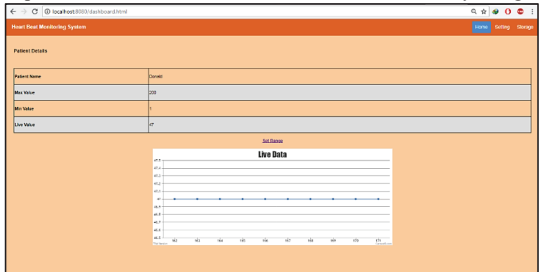
Fig. 2. Example of an Interface Design

The product prototype is developed based on user requirements, and then tested based on the functionality using