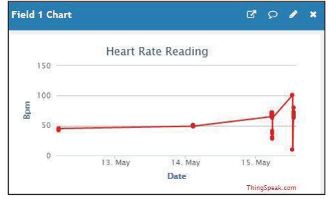
Fig. 4. Example of Real-time Monitoring at the Cloud Server

This section presents the results from the testing phase. Fig. 4 shows the captured reading that is recorded in the cloud server. This testing is one of the functional testing being done. The inconsistent reading is purposely created to see if the plotted graph successfully captured the data.