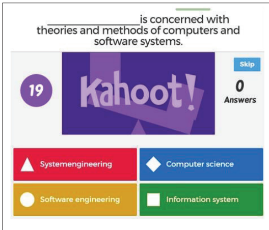
Fig 1. Kahoot: Lecturer view

Based on the definitions above, we proposed to use gamification mechanism in the Software Engineering class. In this study, we use Kahoot as the platform. Kahoot is known as web game-based learning platform that makes learning fun to learn in any subject, in any language, on any device and for all ages. Figure 1 is the interface of Kahoot for lecturers and student.