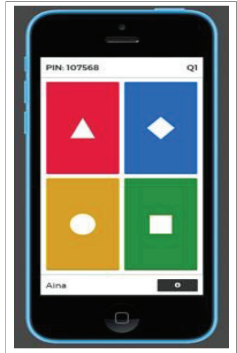
Fig 2. Kahoot: Student view

During the intervention, all students experience gamification in software engineering class. At the end of the study, students answered a set of questionnaires.